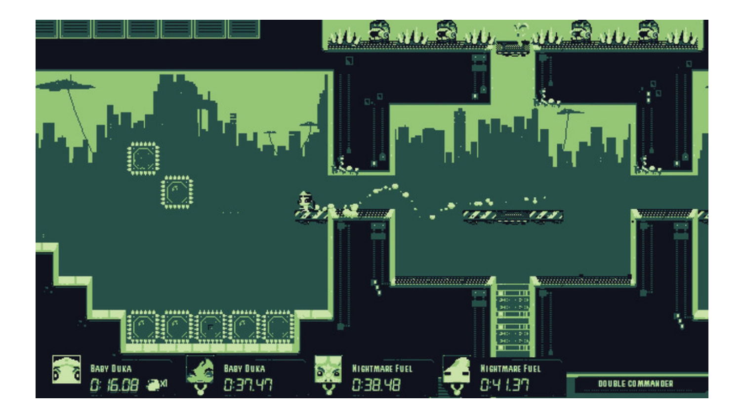
DASH: Danger Action Speed Heroes Torrent